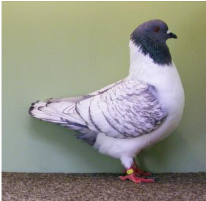
Left: A blue white chequer Moravian Strasser, breeder: G. Kortenhof.

with black bars and bar-less and chequer; and Mealy and Cream barred and chequer.