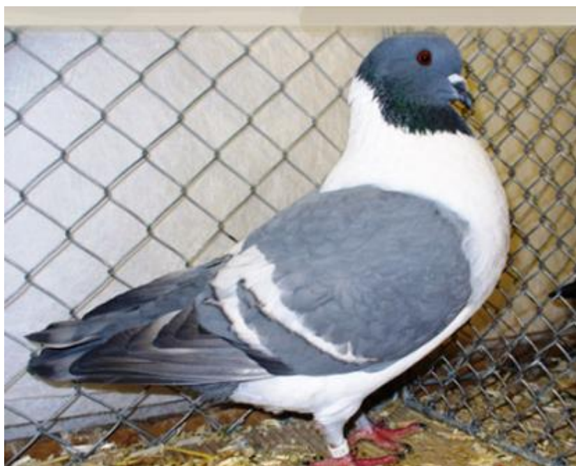
Below: Blue white barred Moravian Strasser, breeder: G. Ruf.