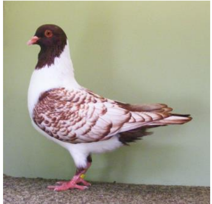
Right: Red laced Moravian Strasser, breeder: G. Kortenhof.

The Black and the Red with very intense sheen are the most popular varieties, next comes the Yellow which should also have a very good lustre and intensive colour, also the special colour 'Steel blue' with black bars and bar-less is very popular with the breeders. Other colour varieties are: Blue and Dilute Blue