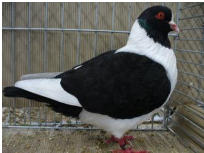
Left: A black Prachen Kanik, breeder: W. Moser.