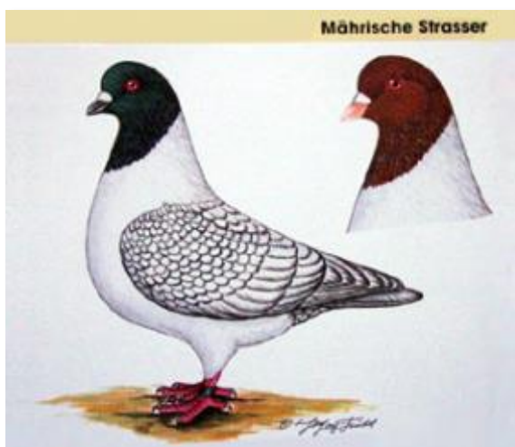
Left: Standard drawing by J.L. Frindell.