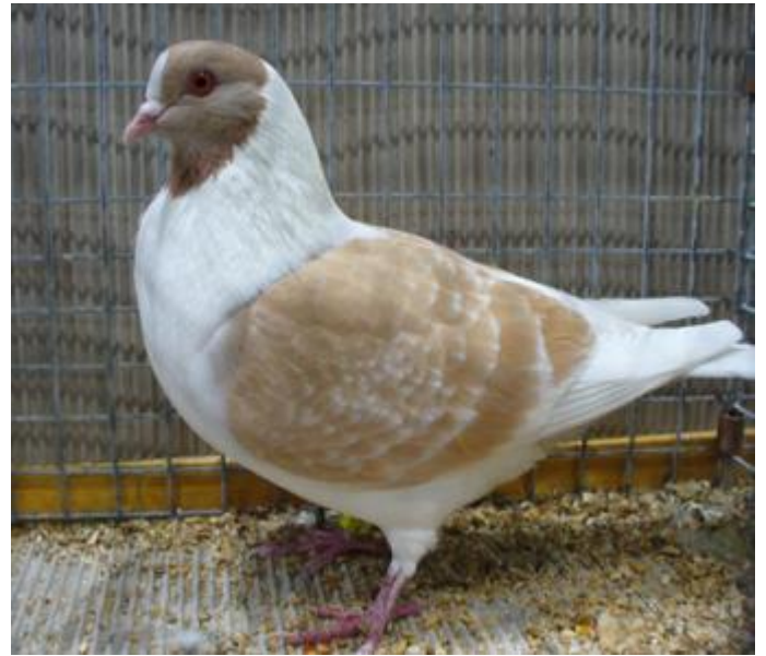
Right: Ash yellow chequer Prachen Kanik, breeder: C. Teichmann.

The ratio of Moravian Strasser : Prachen Kanik breeders is plus + - minus of 4 to 1, however, quite a few breeders have both breeds in the loft. To exhibit both breeds you will have to do some show preparation (trimming). This requires some experience, but you can quickly see the bird improve in your hands. You can learn a lot from experienced breeders which are often real artists in show presentation. Among the breeders are also quite a number of judges, two of which are appointed as 'Zuchtward' (a person nominated by a Breed Club to collect data on the Breed during the course of a show season and relay this Data as a report to the Club, Judges and all concerned with that breed).