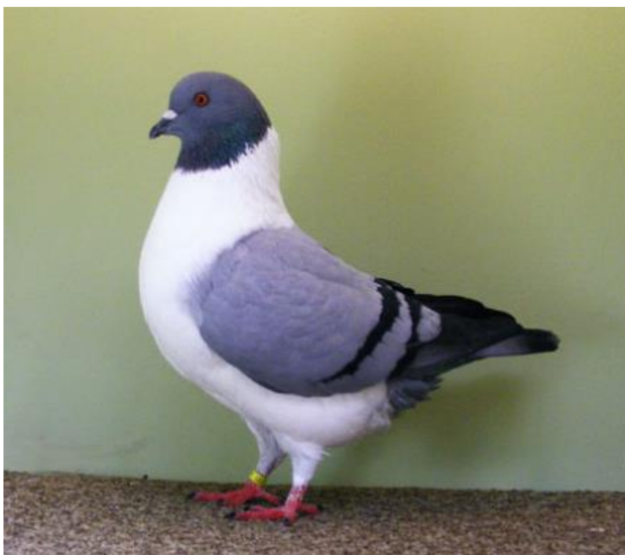
Right: Blue black barred Moravian Strasser, breeder: G. Kortenhof.

The back is broad and slightly sloping, the wings covering the back, but without crossing. The legs are medium length, unfeathered, nail colour to match the beak colour.