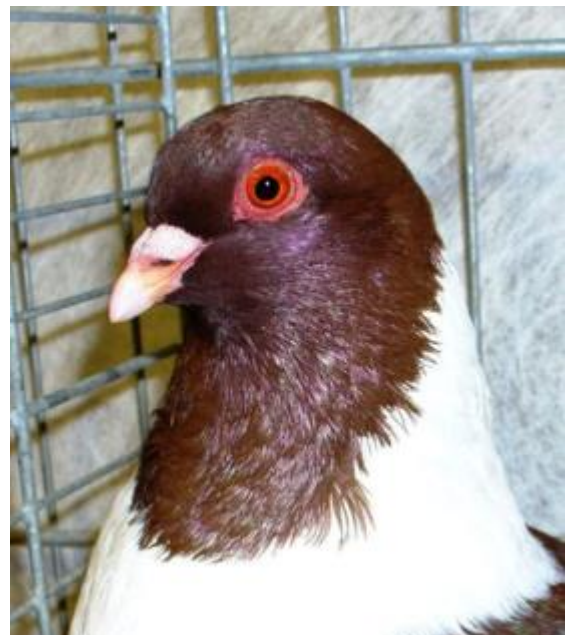
Right: Red Moravian Strasser, head study, breeder: G. Aigner.

Actual breeding is straightforward. Moravian Strasser are known to be good breeders and exemplary parents. When you start breeding early in the season, you can easily rear four rounds of young. They must be provided with a basic but decent loft with reasonably large breeding pens. A standard pigeon mixture is sufficient together with grit and mineral mixture. There are breeders that allow their pigeons to fly free, which is, of course, a beautiful sight with the Strasser marking, but as it quite usual now-a-days, many fanciers also have to keep them in aviaries.