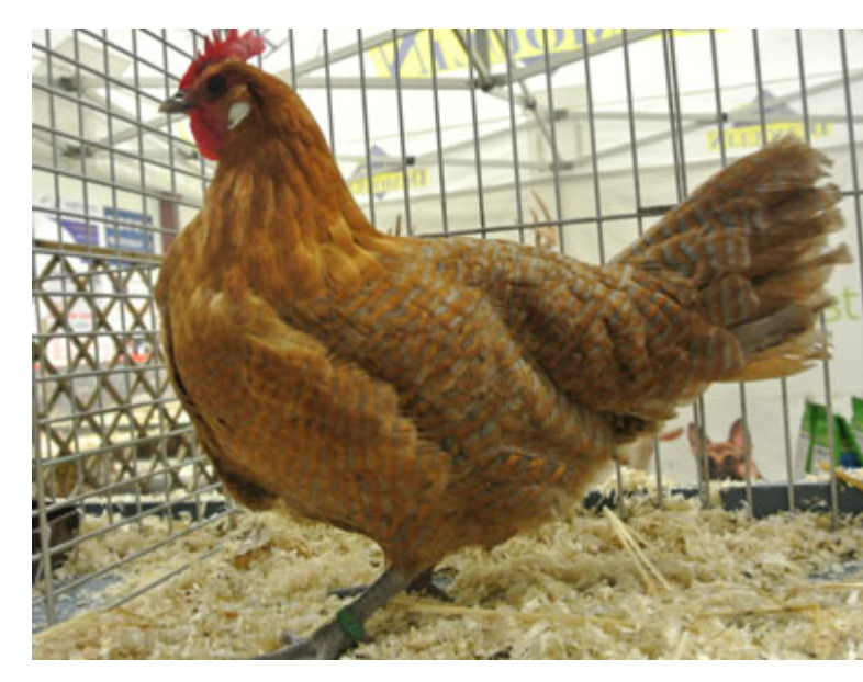
Above and below, left: Gold blue barred Brakel bantams.