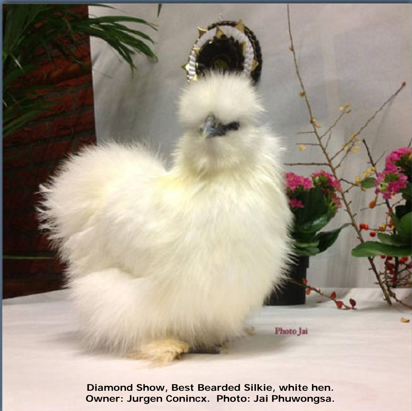
Diamond Show, Best Bearded Silkie, white hen. Owner: Jurgen Conincx.