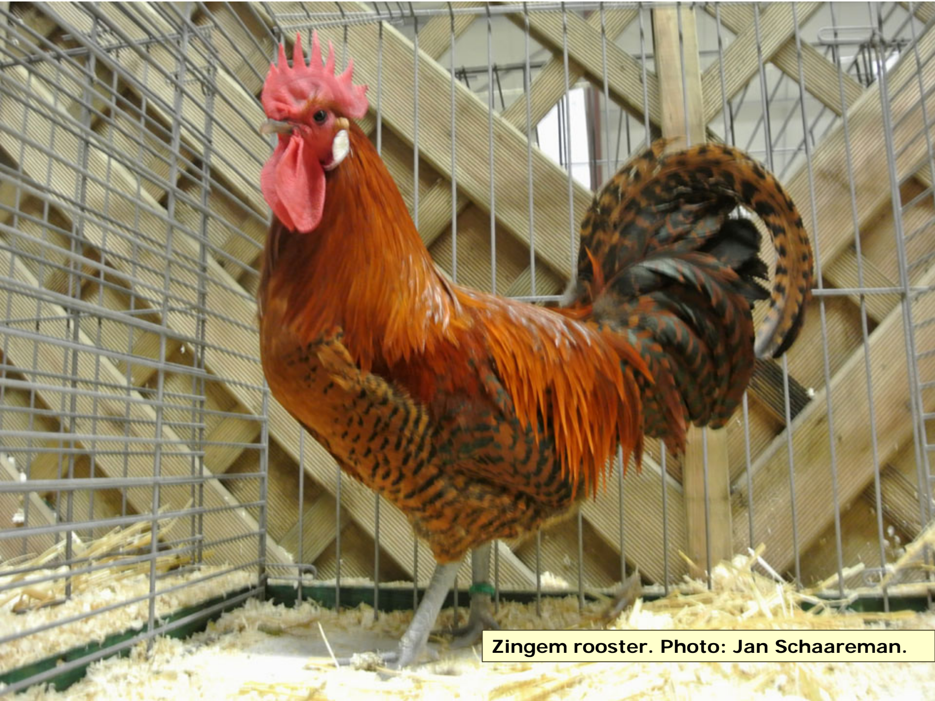
Zingem rooster.