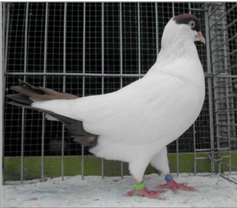
Left: Another very beautiful Dutch Helmet, also by Henk de Vos.

The standardised colours are: black, red, dun, yellow, blue and silver. The coloured parts are the upper head and the tail. The head marking (cap or helmet marking) should be an even line from the point between the two mandibles (edge of the beak), just under the eye and around the back of the neck.