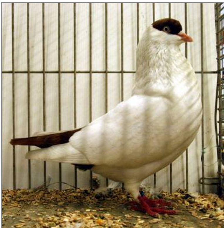
Left: Dutch Helmet, red, young male. According to the judge's report, the feathering was a bit loose. In this photo, the wings should be carried on the tail. Awarded 95 points at the biannual Fancy Pigeon Show of South Netherlands, November 2012 in Loon op Zand.