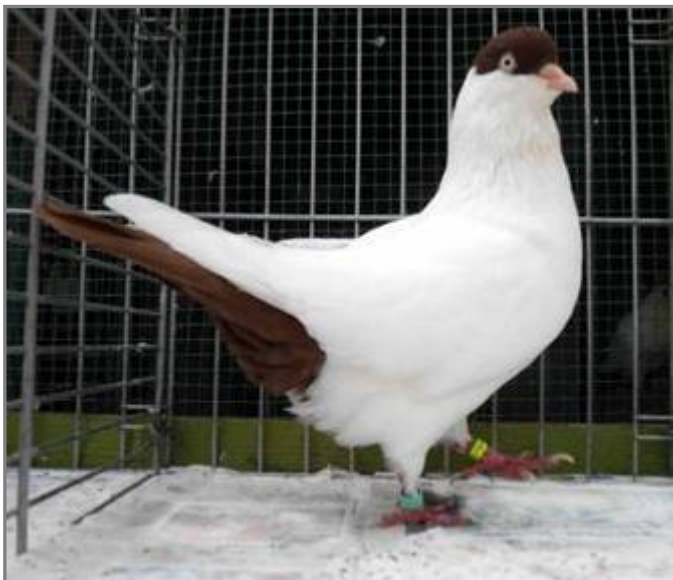
Left: A beautiful red Dutch Helmet cock by Henk de Vos. Photo: Aviculture Europe.

Right: Another bird by Henk de Vos. Usually, Helmets are not born with a perfect 'helmet' marking. It is permitted to trim some offending feathers which spoil the markings. Be careful though, as too much trimming will only make things worse. Photo: Aviculture Europe.