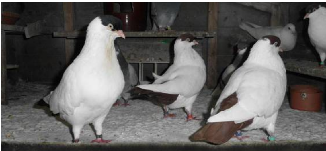
Below: More Young Helmets ....