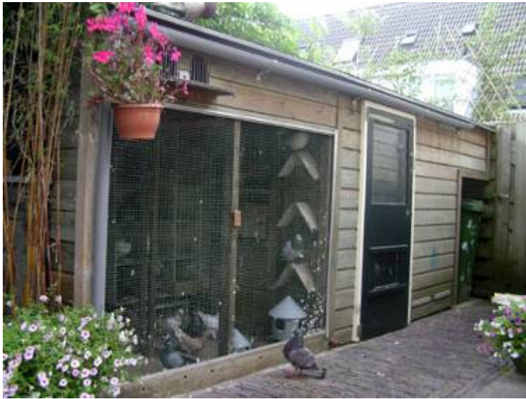
Right: The part of the loft for the young Dutch Helmets. In the middle a red Helmet and on the left a black Helmet. The pigeon in the right is a dark barred silver (dilute blue) Amsterdam Bearded Tumbler.