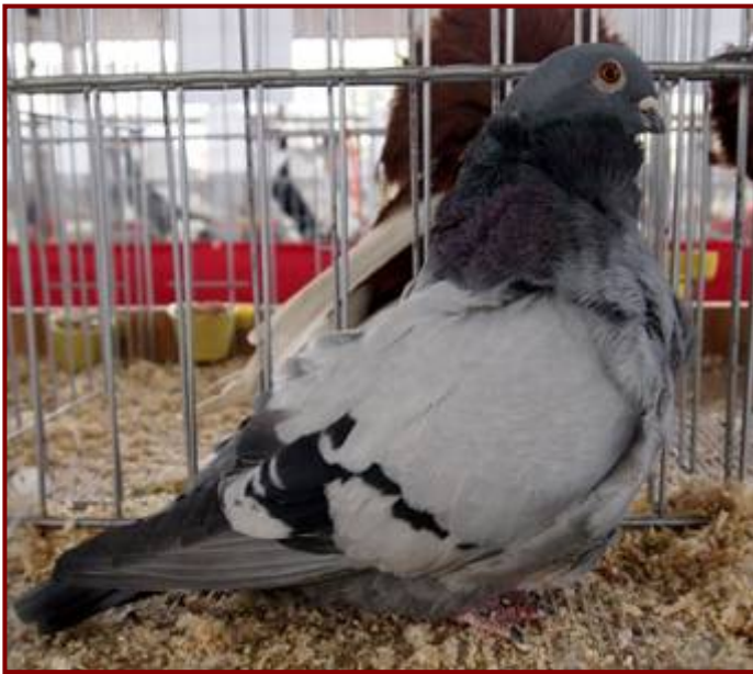
Left: Chinese Owl, blue black barred, male. 97 Points.