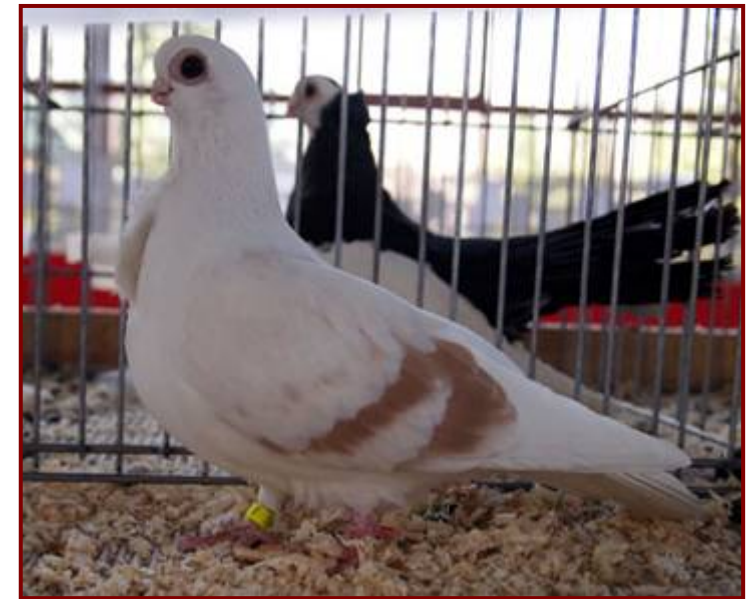
Above: Bulgarian Shield Owl, ash yellow barred, female. 96 Points.