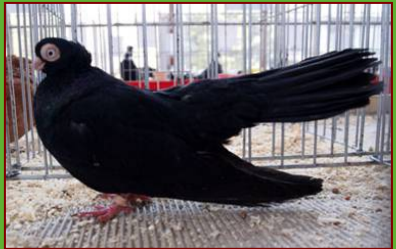
Below: Pleven Roller Pigeon, black, male. 96 Points.

From 23.03.2012 to 25.03.2012 in the town of Targovishte, Bulgaria, the Second International Exhibition of pigeons, poultry, cage birds and rabbits was held. The exhibition was organized by the Union of pigeon and nature lovers in Bulgaria, Club of breeders of small animals "Peace", Targovishte and Organization of the pigeon breeders "Pigeon of Peace", Shumen. Parallel with the exhibition a large livestock market was held.