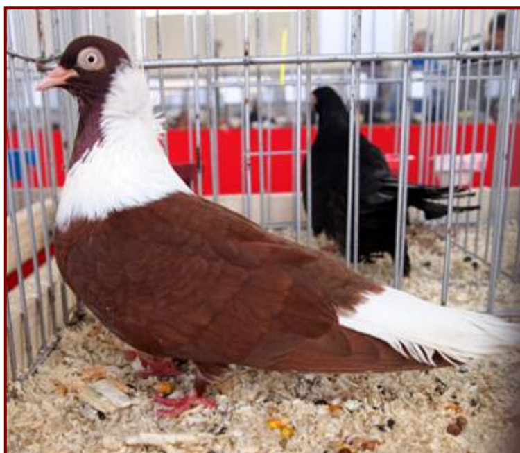
Right: Sliven Roller, red, male. 96 Points.

With great joy and optimism for the future of our wonderful hobby I follow the more and more frequent, large and well-organised exhibitions in Bulgaria. The participation of young people ensure a better future for the fancy poultry. I hope that in the future the poultry as a hobby will attract more followers in Bulgaria and the exhibitions to become more important and to gather friends and colleagues from all over Europe.