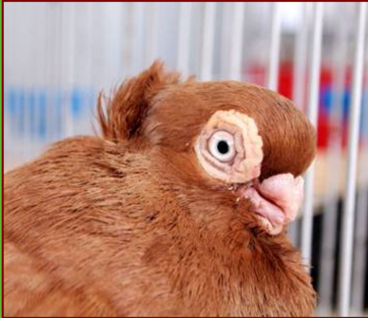
Left: Pleven Roller Pigeon, red, male. 95 Points.