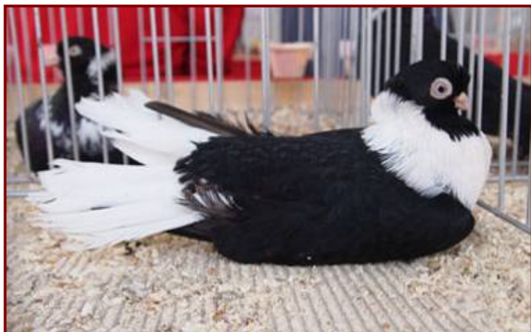
Above: Shumen Collar, black, male. 96 Points.

Also the participation of good chicken specimens of Modern English Game bantam, Chabo, Yokohama and Brahma is worth mentioning.