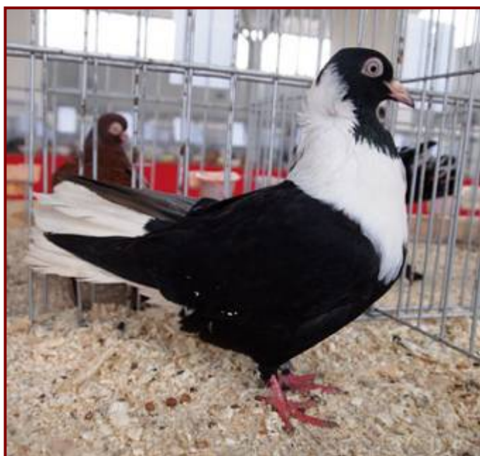
Left: Sliven Roller, black, male. 95 Points.

Some of the mentioned breeds are recognized by the Entente (EE). More than 12 breeds of pigeons will be presented at the exhibition in Leipzig for recognition this year. I hope over time the Bulgarian chicken breeds to be presented at European exhibition for recognition.