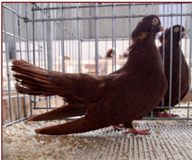
Left: Rouse crested, red. 95 Points.

The Grand Champion title at the exhibition was awarded to a Shumen pigeon owned by Trifon Trifonov. The title "Champion" was dedicated to 62 birds, being 56 pigeons and 6 birds in Poultry section.