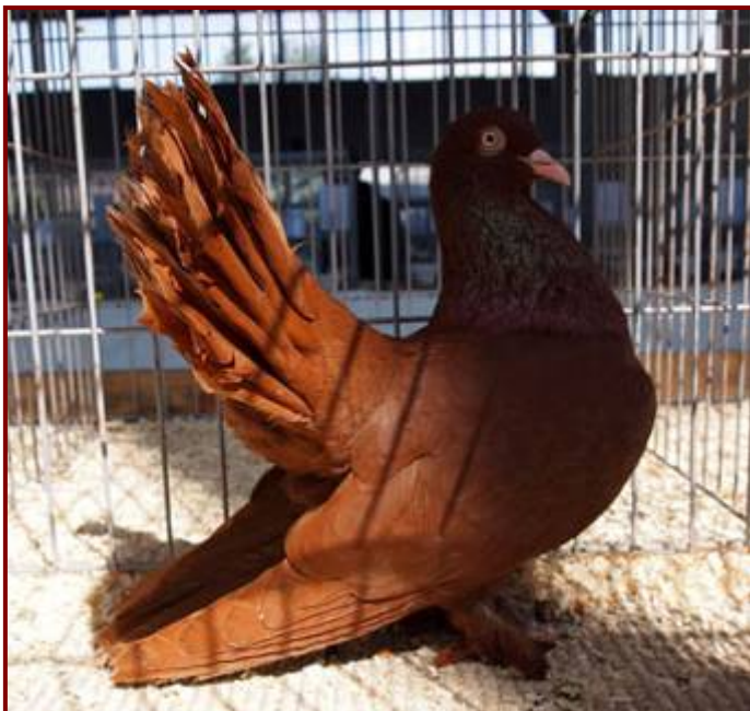
Left below: Hungarian Debrecenski Roller, red, female. 96 punten.