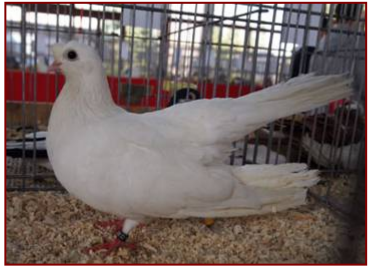
Above (left and right): Aytos Bovine, white, female. With head study. 94 Points.