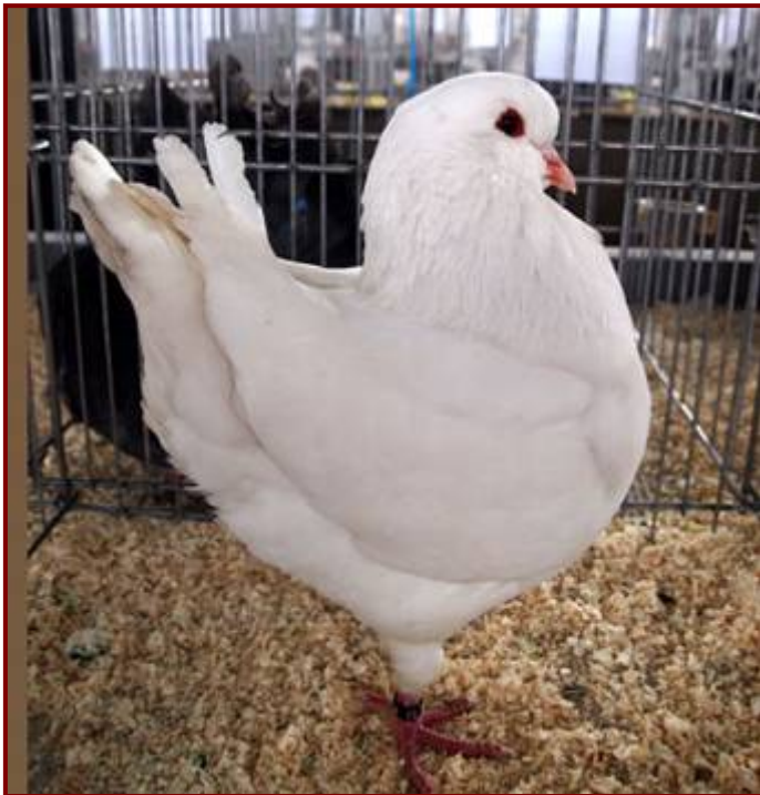
Left: King, white, female. 96 Points.