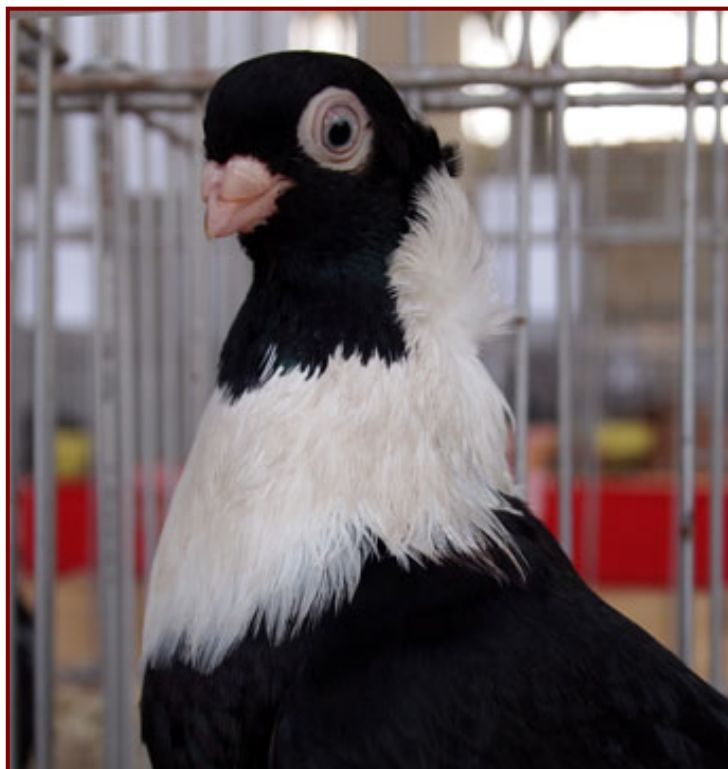
Right: Shumen Collar, black, male. 96 Points.

Some of the mentioned breeds are recognized by the Entente (EE). More than 12 breeds of pigeons will be presented at the exhibition in Leipzig for recognition this year. I hope over time the Bulgarian chicken breeds to be presented at European exhibition for recognition.