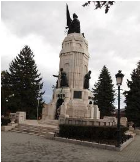
Below: The Memorial Mother Bulgaria-Veliko Tarnovo.