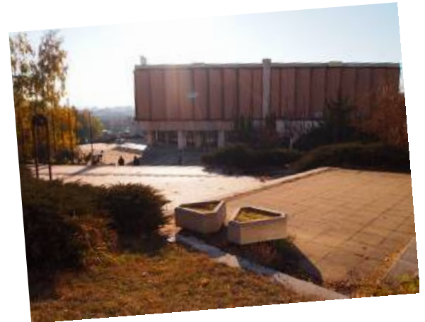
Left and above: Sport Palace in Veliko Tarnovo (Bulgaria).

At the end of November, 2011 in the old capital Veliko Tarnovo was held the First of its kind Pigeon Exhibition in Bulgaria, in the hall of the Palace of Culture and Sports in