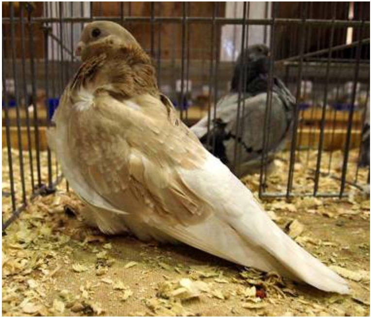
Above: Chinese Owl, ash yellow. Owner: Tzvetan Dimitrov.

The main emphasis was given to Structure pigeons and Oriental Frills, representing the one third of the exposed birds. From the Structure pigeons, the Fantail pigeon (196 specimens) had the largest entry, followed by Chinese Owls (60 pigeons) and Jacobin pigeons (with 61 entered pigeons). With presented 132 specimens the exhibition is the largest until now in Eastern Europe for the Oriental Frills category of pigeons. Traditionally more well represented have been Blondinette (92 specimens) in comparison with Satinette (40 pigeons).