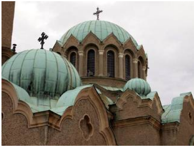
Above: Kolyu Ficheto's Cathedral.