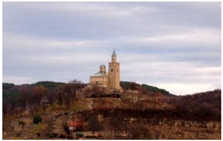
Above: The Royal palace in Tsarevets.