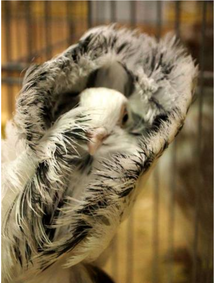
Left: Jacobin Pigeon Black pied monk.