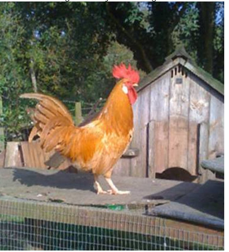
Above and Right: English type Buff Leghorn bantam cock and hen. Photos and breeder: Alexander Hales, England.

Due to the magnificent laying capacity, it was not only kept as ornamental fowl, but also as utility chicken. For many decades, the Leghorn has been the perfect utility breed until the hybrid breeding was introduced. However, the Leghorns still play an important role in the establishment of high egg-producing hybrids. In 1888 the first Buff Leghorns were showed.