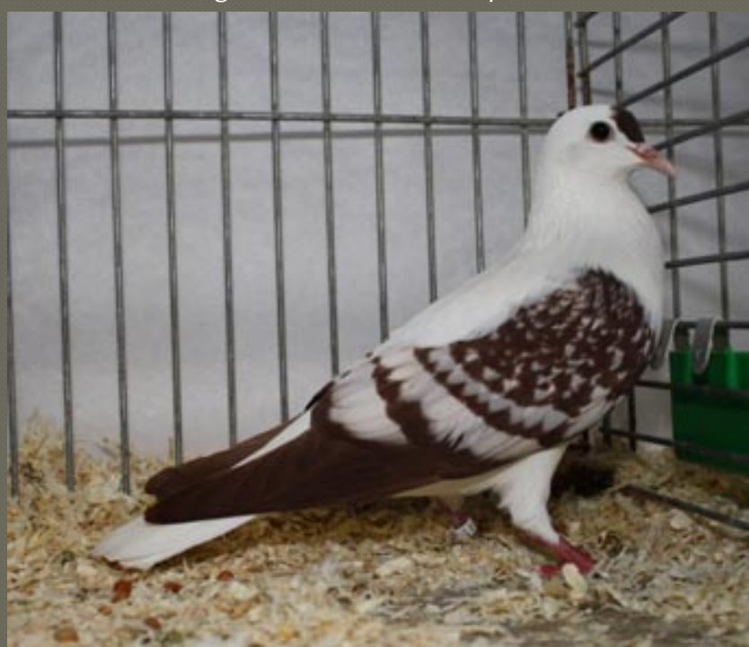
Thuringian Wing pigeon. This bird is not red white barred, but red white chequered. 97 points. Owner. W. Roelofs.

Article: The Pigeons at the Champion Show. Correction to the following captions: