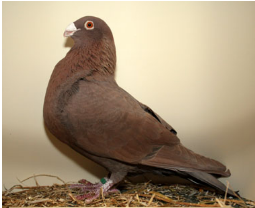
Below: A Morrillero of Simon van Leijen. In the A.O.C. class m/y, with 95 points. It is difficult to get this breed showing off. This cock must show much more typical blowing in the neck. But as happens with males, he is in action, by cooing, as you can see below right.