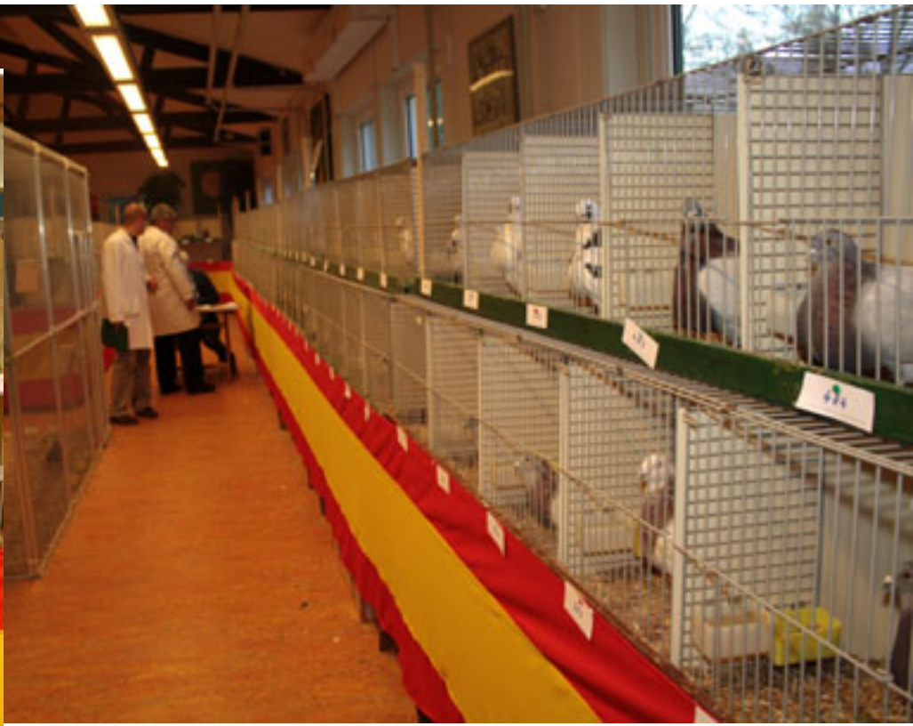
Left- and above: A beautiful show, with new drapery around the cages in the Spanish colours. Left you can see one of the Winner's rosettes on the cage.