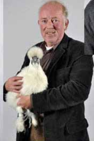
with our thanks to the Dutch Silkie Club.