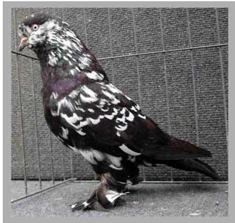
Below: Two Gray lace white bar (reduced black) baldheads. Owner: Bob Christman.

Of course all these breeds were not crossed by the same fanciers to their West's but rather these breeds were crossed singularly by various fanciers. Some crossed to get more performance (usually more tumbling), some to add some different than what was available in West's color, some to get longer and fuller muffs, some to perfect or add some marking or pattern to their West's. Some after a cross found their West's no longer flew as high and long as the original West's or no longer tumbled so they crossed another breed (usually Rollers) to their West's to get these traits back.