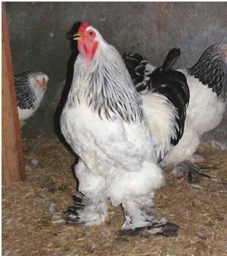
Left: White black columbia Brahma.