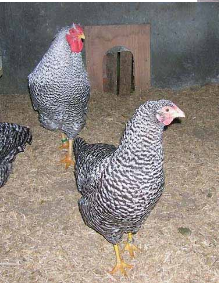
Above right and left: All chickens have spacious coops, but they also can go outside if they want to. The Brahma and Dominikaner have separate outdoor areas to range.