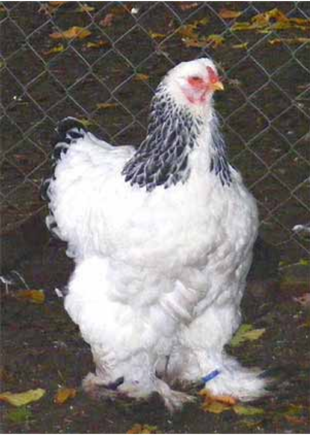
Left: His Brahma often win prizes at the Shows, no wonder, for as you can see in this photo, this is a beautiful hen with the characteristic 'Brahma head'.

As the breed was already recognised in Germany, it was not too hard to have it recognised in Holland. It happened the following year. He had to enter a number of birds at an 'open' show, were they would be judged by two judges and if given a positive recommendation, they could be entered at the next Noordshow (the National Show of the Dutch Poultry Union).