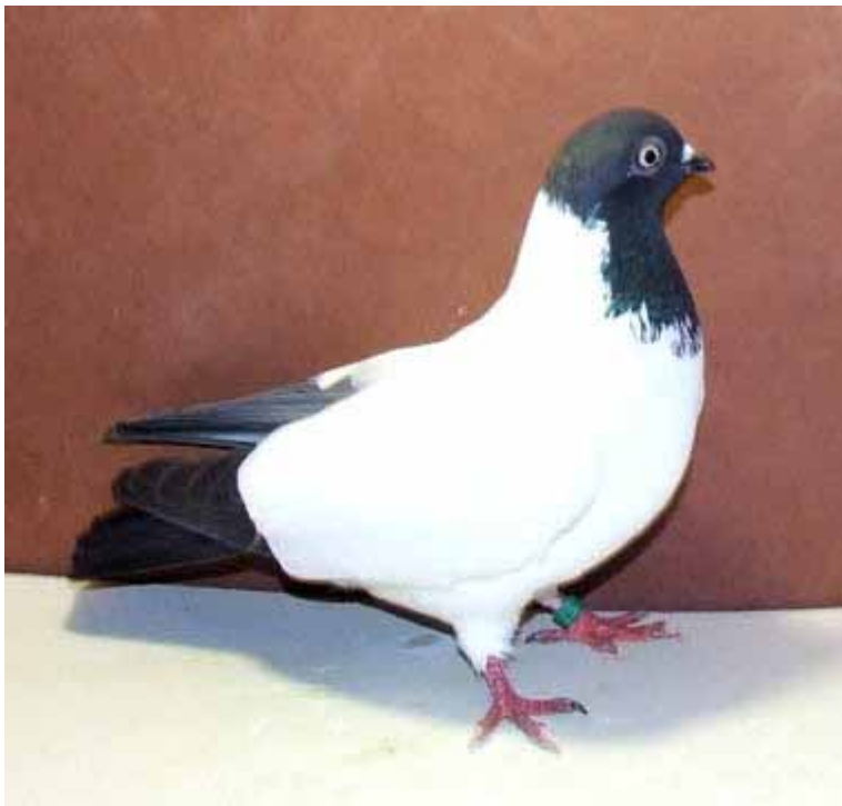
Left: This is a Monji Girat, or the Spanish Nun pigeon. This is another one of the Catalan Flying Pigeon breeds.