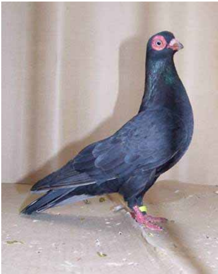
Left: The Spanish 'Barb' is named Ojo de Fresa (strawberry eye) and is a lot smaller than the other 'Barbs', such as the German Indianer , the French Polonais , the Dutch Valkenet , the English Barb, etc ...