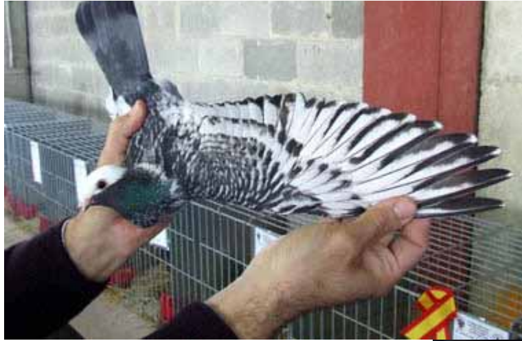
Below left and right: This is the same Cap de Frare, presented with its wings open. A perfect picture, regarding colour and marking.