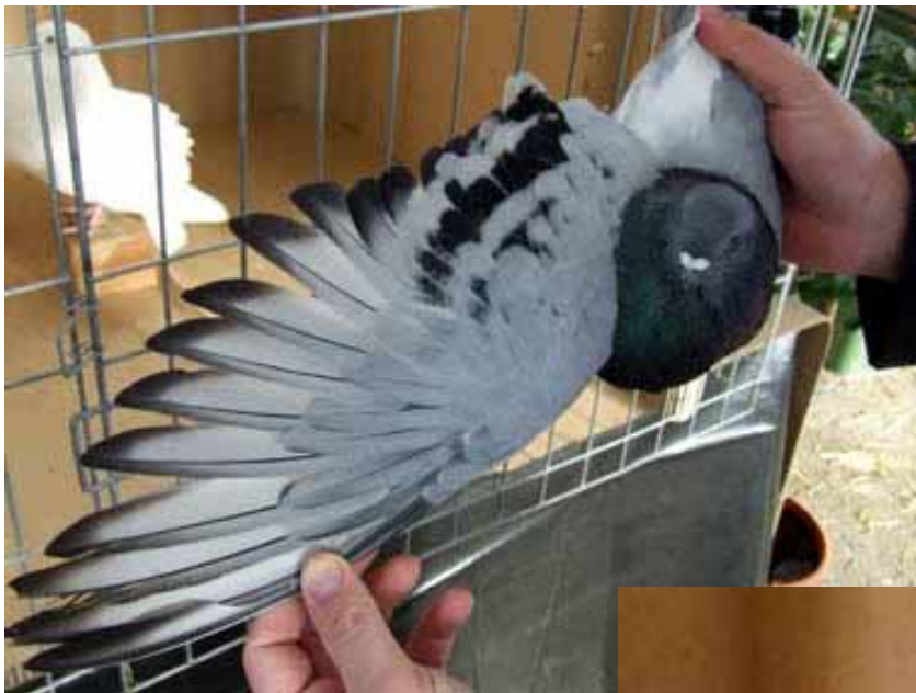
Left: Marchenero Cropper, blue black barred, with sooty factor. In Spain this spotted colour marking at the wing shield is seen as a naturally feature of the breed.