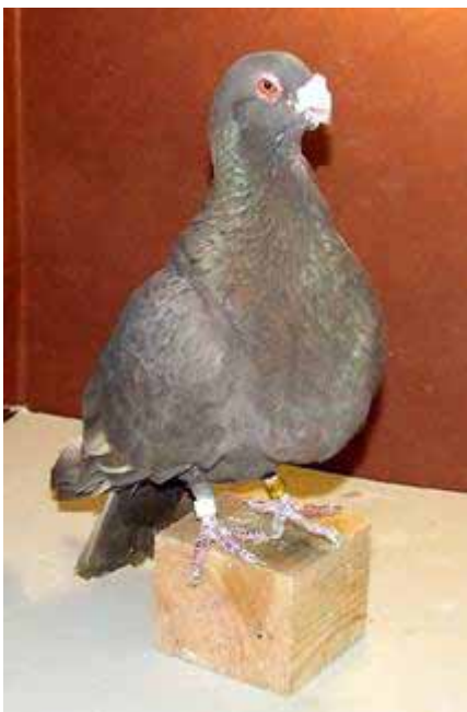
Left and right: The same Granadino Cropper, brown. One of the Champions of this Show, and a true beauty in all points.