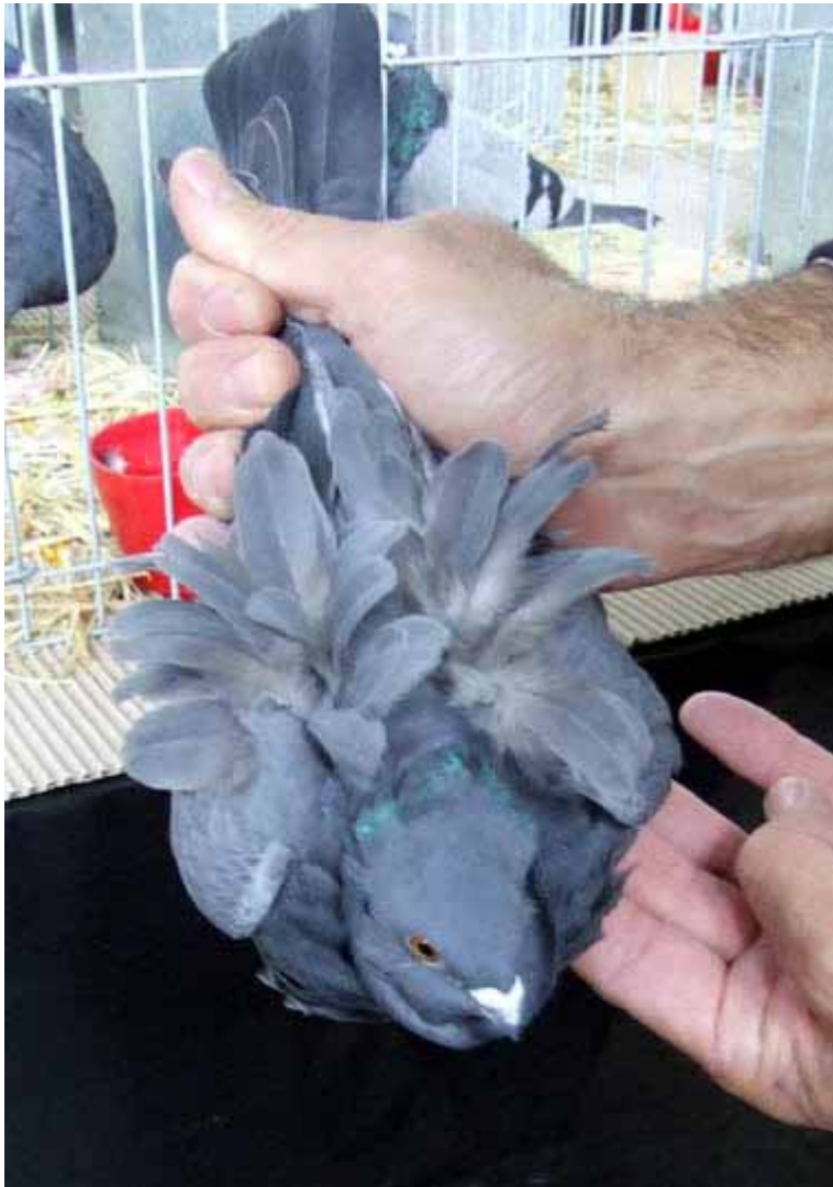
Left: These are the both rosewings of a Chorrera pigeon. According to connoisseurs this breed is supposed to be the ancestor of the Chinese Owl, but this must be a far way back, as today these breeds are grown apart.