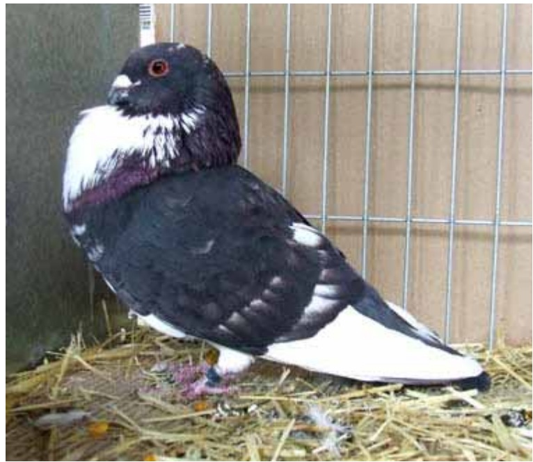
Left: The same pigeon, with a close-up photo of the 'broken' eye.

Right: An outstanding Moroncelo with the proper head form, colour and markings. They come in white flight or coloured flight, and both dark or orange eyes are allowed. But not like this: a broken eye, only half orange. Also both eyes have to be of the same colour.