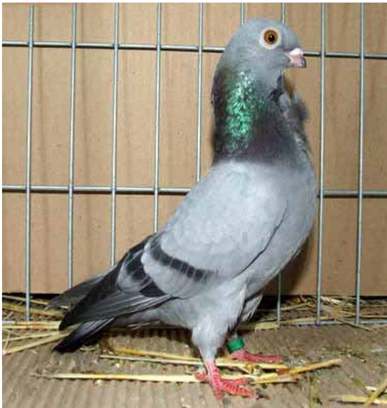
Left: This blue black barred Figurita-Valencian Frill, was Best of Breed and Best of all Spanish pigeons. Owner: Ramon Amenos, from Vals (Esp).