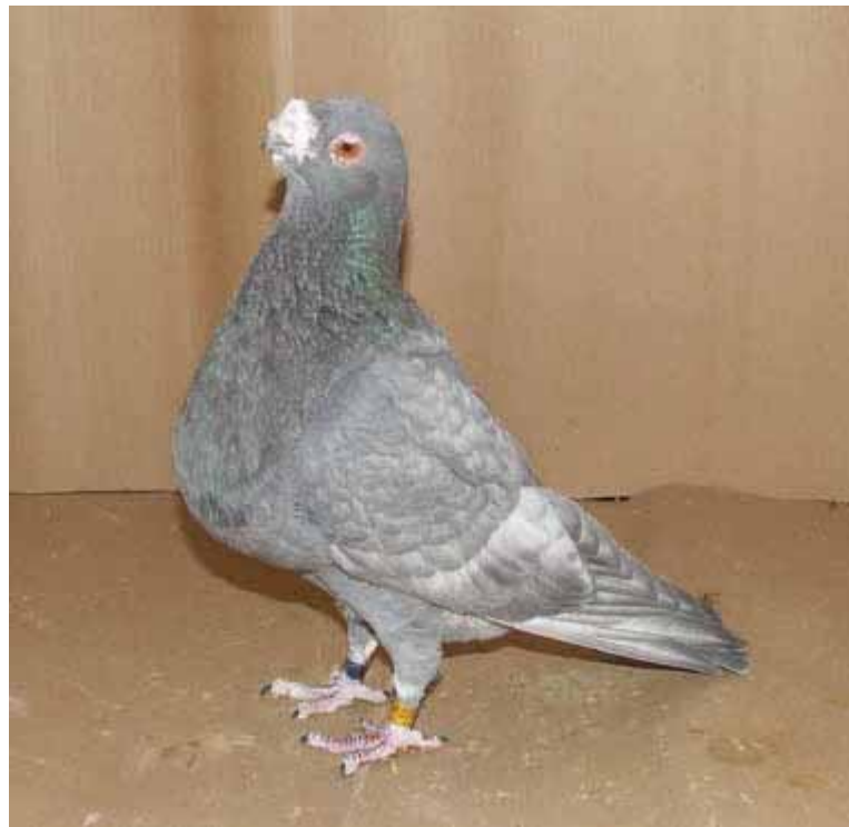
Left: Figurita–Valencian Frill, blue black barred.