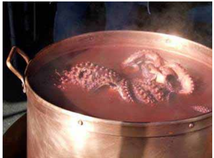
Above: Or would you prefer some Octopus? They were cooked for about 10 minutes and then served in slices, sprinkled with spicy olive oil. Very tasty!