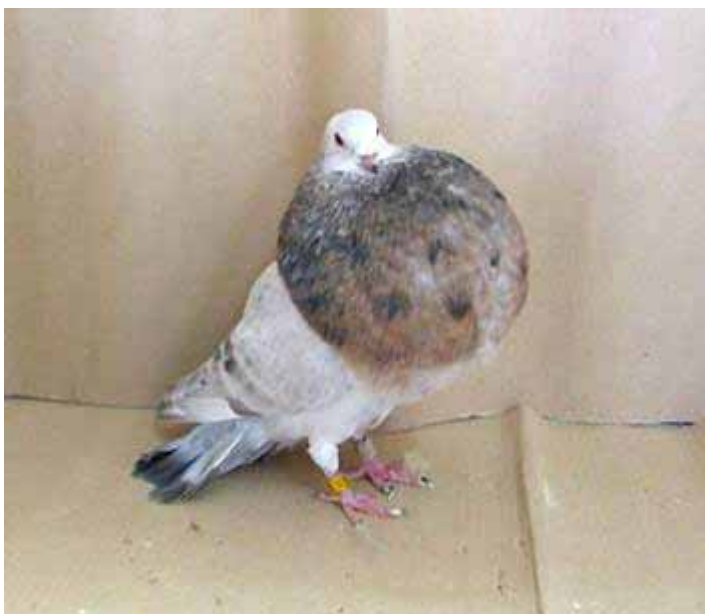
Left: Back to the pigeons. Here you see a Gaditano Cropper, in blue silver chequer.