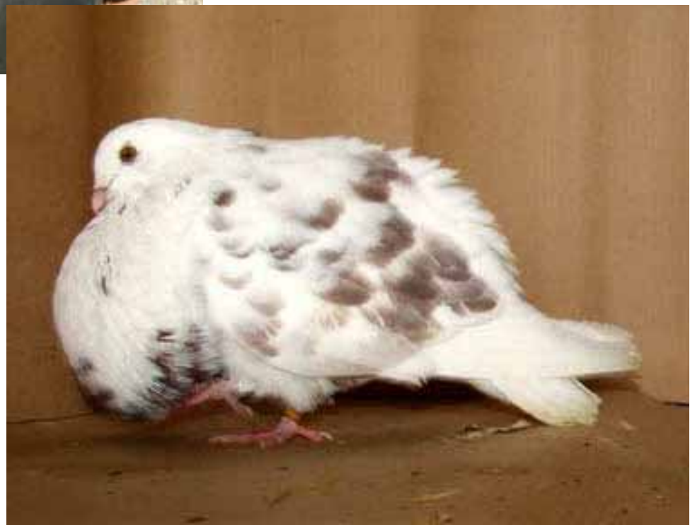
Right: Another Marchenero Cropper, which was not at ease when photographing. Thus it is not posing as it should. We chose to picture it because of the grizzle marking in an indefinable colour, which will hardly ever be seen at our (Dutch) shows.