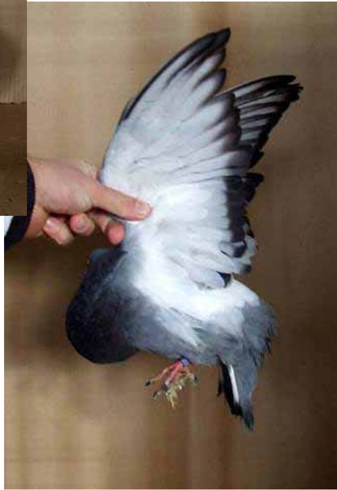
Right: In Spain, the pigeon's back and tail are often judged in this particular way. Indeed as such the bird shows the full width of its somewhat rounded back (carp back). Also when held in this way, the bird will open its full breast feathering and expose the wonderful rich plumage of this breed.