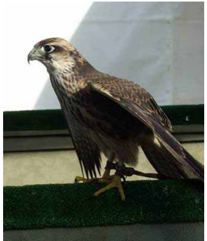
The Bird of Prey Show attracted young and old.