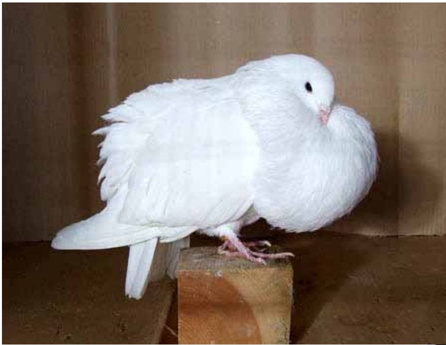
Left: A white Marchenero Cropper, a rare beauty with perfect back and tail action. Type, stance and crop are ideal. Such quality is seldom seen!