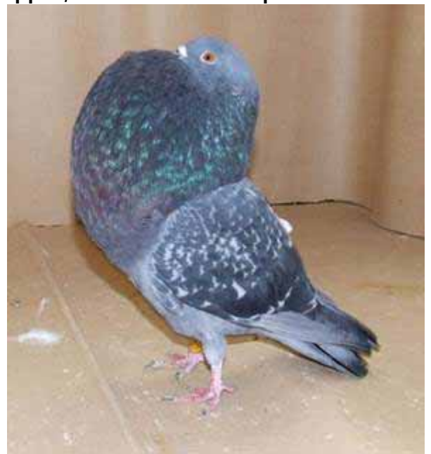
Right: Gaditano Cropper hen, in blue chequer. And as often seen in the hens, too upright in stance.