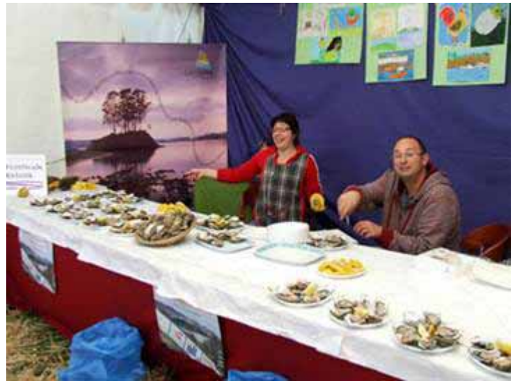
Below right: For those who were hungry, a plate of fresh oysters was hearty recommended!