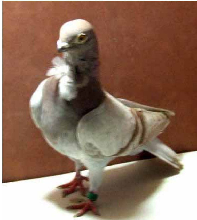
Right: Figurita-Valencian Frill, ash red barred, with a very rich feathered frill, excellent type and perfect stance.