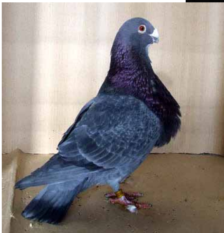
Left: Laudino Sevillano Cropper, Blue chequered. Best of Breed, and a real show bird, as seen in his pose!