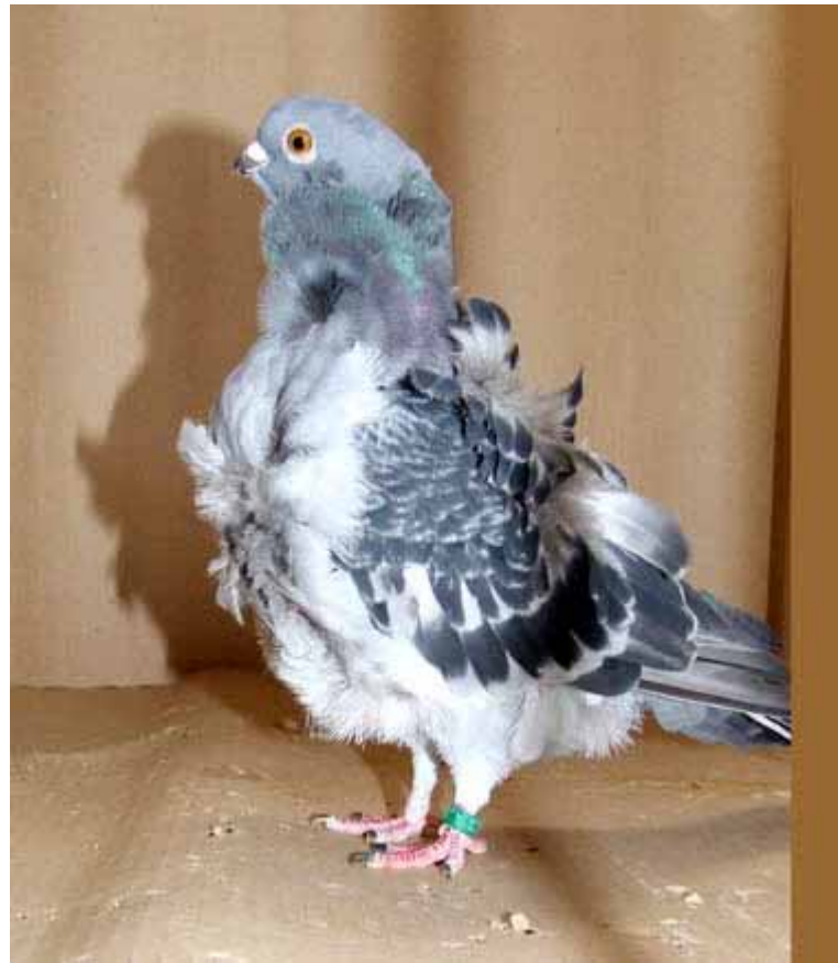
Right: The Chorrera, a remote kin of the Chinese Owl, although this Spanish Chorrera distinguishes itself from the Chinese Owl by its rosewings and also it is a bit smaller.