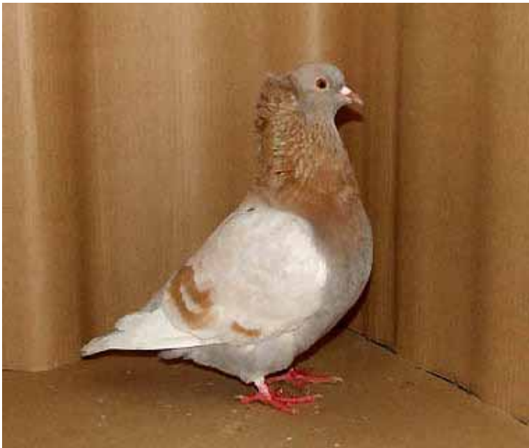
Left: Of course there were also 'foreign' breeds entered at this Show, such as this yellow barred Sotto Banca cock.