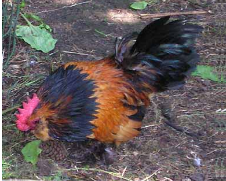
Above: A quail coloured cock. Left: A blue quail cock. Both birds were photographed at Frans Smets' in Belgium.