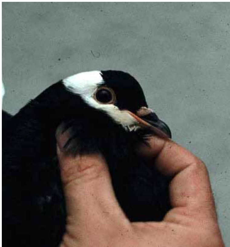
Left: The Snip of this Reversewing Cropper is too large. Very good upper beak.

With Reds an intense, deep and even Red colour is wanted and that is all over! No bluish sheen should be present; this is a fault. Such birds should also be excluded from the breeding programme or if used, used with care. If the Red is too pale, then flecking in the tail feathers may occur. If the Red is too dark, then it is possible that the feathers have poor structure and become hair like; often then the colour of the upper beak is incorrect (too dark).