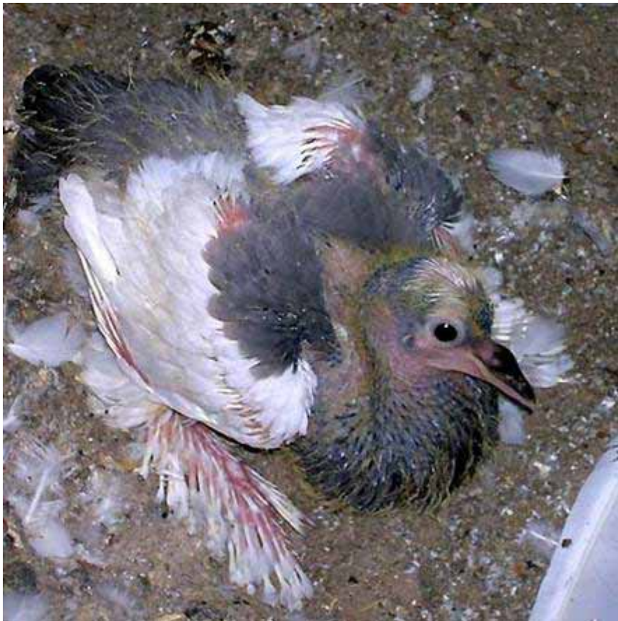
Left: A young Reversewing Cropper at Staf Mertens'.

It is possible to see the eye/head markings at 10 to 14 days old but selection at this time is not practical as the final markings may not be evident before 2-3 years old!