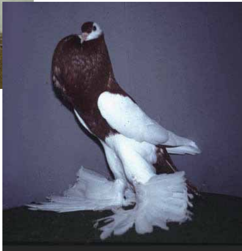
Right: Red Reversewing Cropper, outstanding bird with 96 points. Owner: M.C. Wuyts.

The shoulders should not be too broad, this can cause wing tips that cross badly (they may touch at the tips or slightly cross), or dropped (hanging) wings. A Reversewing Cropper that is somewhat smaller in shoulders still looks elegant, even when of appropriate height.