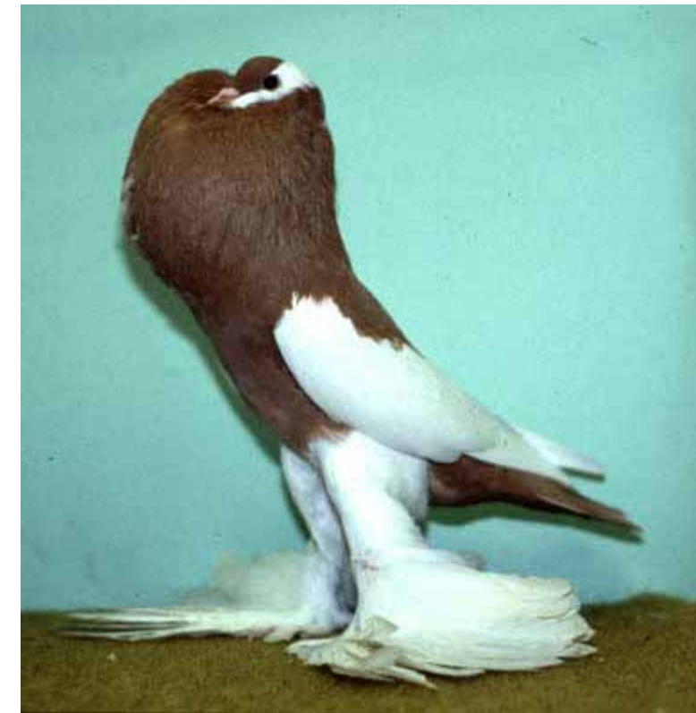
Below: Another old red hen, in 1994. Outstanding bird with 96 points. Owner: M.C. Wuyts.

To attain these perfect balance proportions, a bird must have the desired length of neck and also the correct crop shape when inflated. This must be pear shape; the widest part at the top, flowing into a slight but discernable 'waist' at the lowest point of the inflated crop. From there a few centimetres of body should be visible before the start of the strong and long thighs that should be clearly visible and appear to curve very slightly forward due to the well developed