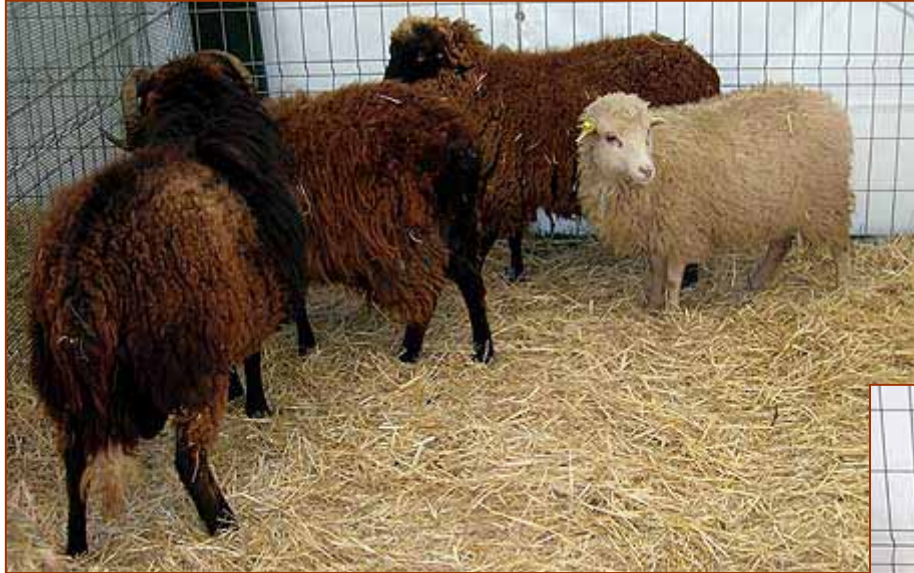
Left: Asturian sheep, the Oveya Xalda. Right below: A goat-breed from this area, the Cabra Bermeya.