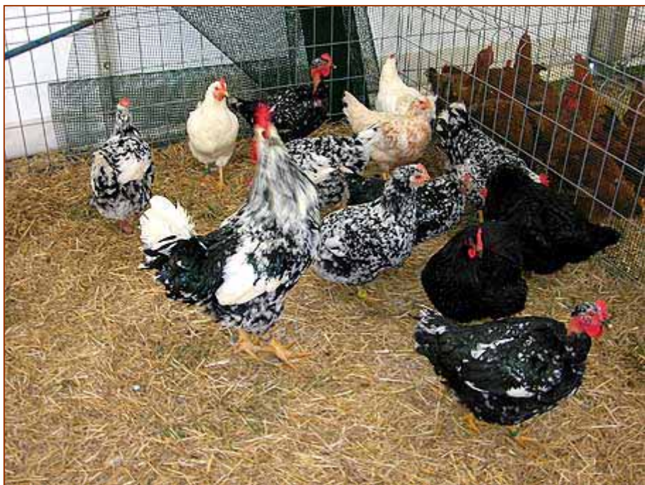
Above left: The Pinta Asturiana in several recognised colour varieties, including the naked-neck. Above right: Pollo Campera, a free-range broiler chicken with Quality Label.