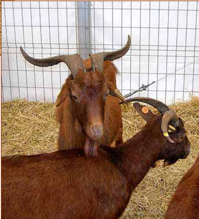
Left: The Asturian horse.