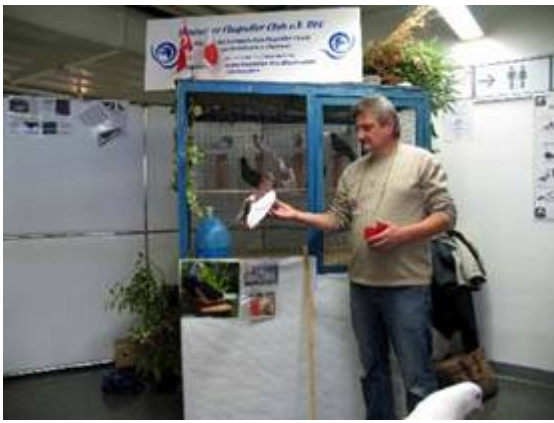
Display stand of the Flying Pigeon Club.

This always attracts a lot of interest from the public.