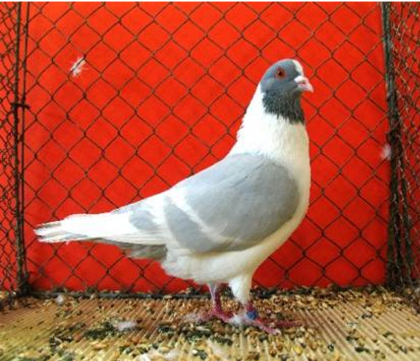
Below: Polish Lynx in the colour red white spangled.