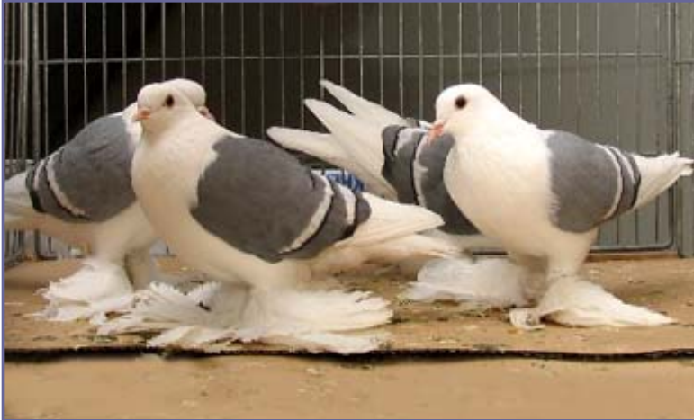
Left: Saxon Shield pigeons, white barred.