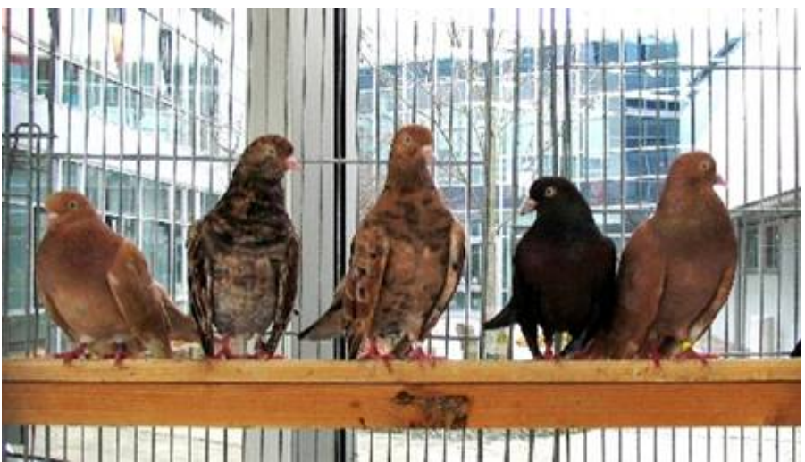
Right: Oriental rollers in various colours in an aviary.

The only 'Champions' at this Show are those selected from the 'Groups' and carry the Title ' Deutsche Champion ' (German Champion, a 'National' Award)