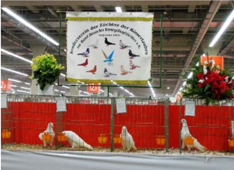
Left: Display stand of the German Runt breeders Club.

To give some idea of numbers: 2,800 German Beauty Homers, 2,000 Strasser, 900 Show Racers (American), 600 Exhibition Fantails, and so on. Many Clubs were taking the opportunity to hold 'Centenary' and Club Shows at this Exhibition, so you had the opportunity to see these Breeds in all their variety of colours and markings as at no other Show.