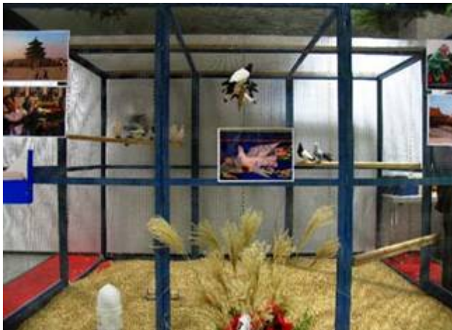
Left: The Chinese Tumblers aviary display.

The VDT Shows seem to get bigger and better each Year! From their start in Nurnberg 1952 with 2,562 pigeons to this year's Show with 35,000 birds from 3,500 exhibitors. From the beautifully designed and produced Catalogue, containing all details of the Show, prizes, grading, prices of birds 'For Sale' from the show pens and much more, to the planning and layout of the Show and to the now yearly event of the Pigeon Auction; birds 'presented' by Top breeders and donated by invitation only! They are auctioned in Aid of Children's Cancer Charities. (This year 10,000 Euro from 16 pairs of birds.)