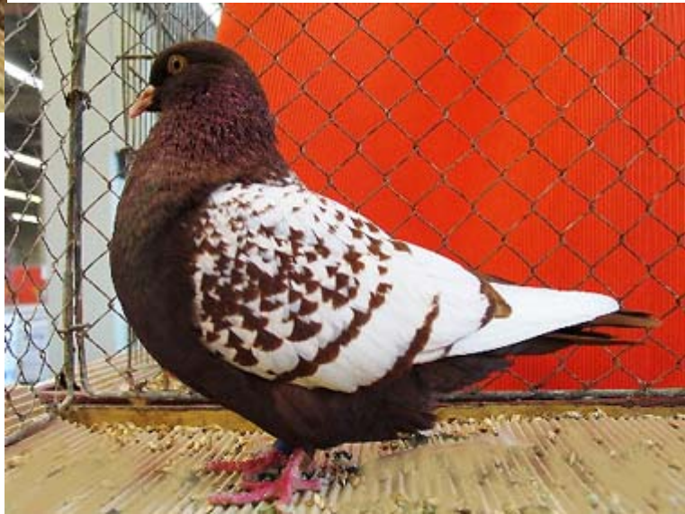
Below: Temeschburger Schecken in black, but actually the correct name of this breed is Timisoara tumbler.