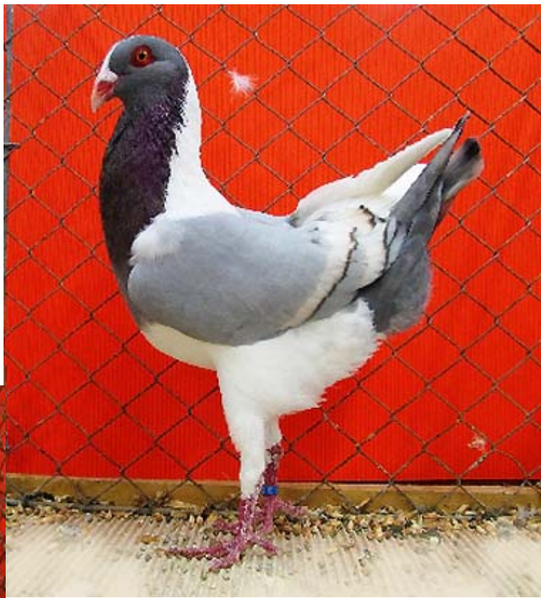
Left: Pratchna Kanick in the colour lightblue white barred.

Luckily that is not too prevalent here, with plenty of dedicated 'hobby' breeders where stock at respectable prices and more importantly LOTS of good advice can be freely obtained.