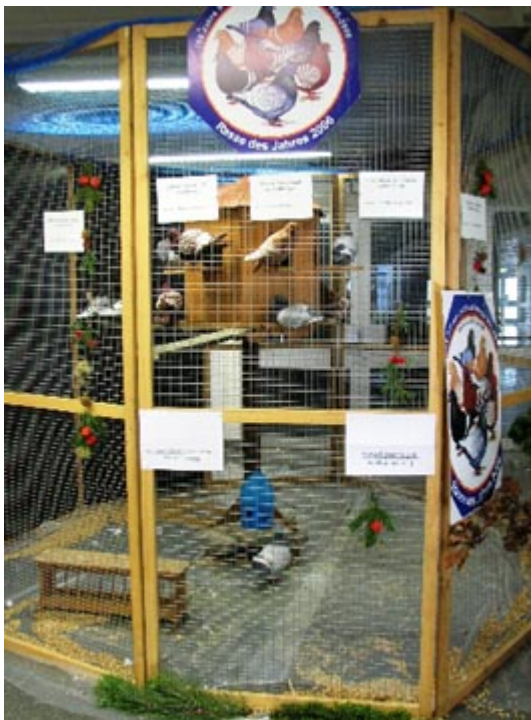
Right and below: Display of the Polish Lynx club.

The VDT Shows seem to get bigger and better each Year! From their start in Nurnberg 1952 with 2,562 pigeons to this year's Show with 35,000 birds from 3,500 exhibitors. From the beautifully designed and produced Catalogue, containing all details of the Show, prizes, grading, prices of birds 'For Sale' from the show pens and much more, to the planning and layout of the Show and to the now yearly event of the Pigeon Auction; birds 'presented' by Top breeders and donated by invitation only! They are auctioned in Aid of Children's Cancer Charities. (This year 10,000 Euro from 16 pairs of birds.)