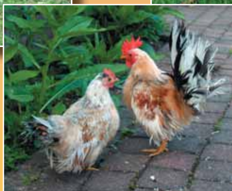
A pair of silkied Serama.

A Serama Marriage. With too less Serama, some birds move to another place because the Serama wants to.