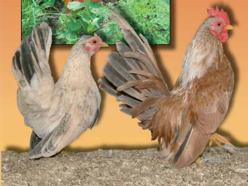
Below: special colours.