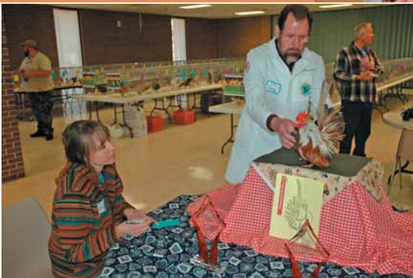
Table judging. On the background carriers who bring the next Serama.

When the owner hasn't arrived yet, club members dress up the Serama for them. Here cutting nails so those won't cost points on Condition.