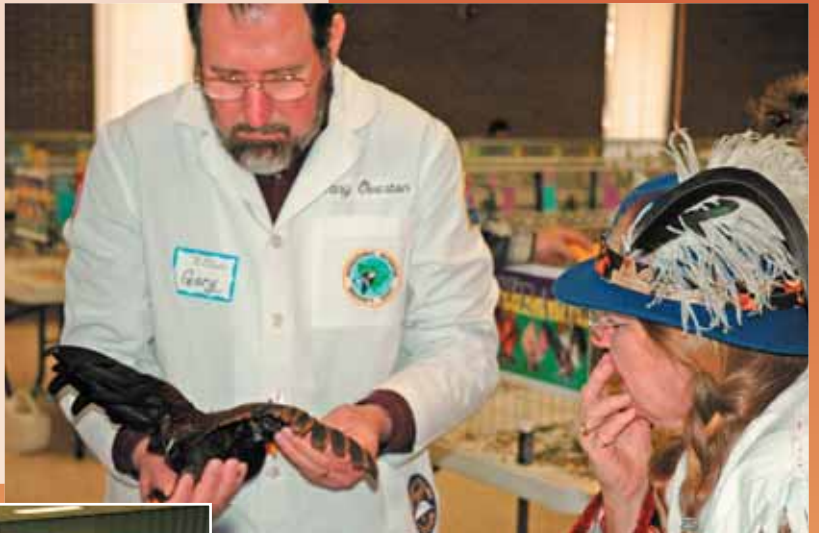
The owner is present during the table judging, here feather quality is judged.