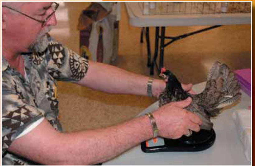
Weighing of a freshly arrived Serama.

Every part of the six consists of several traits by which the Serama is judged. At the end all best animals per class do their things together on the table and they're judged again. From the Class Champions and reserves the overall champions will be crowned. See pics of the Cajun Show.