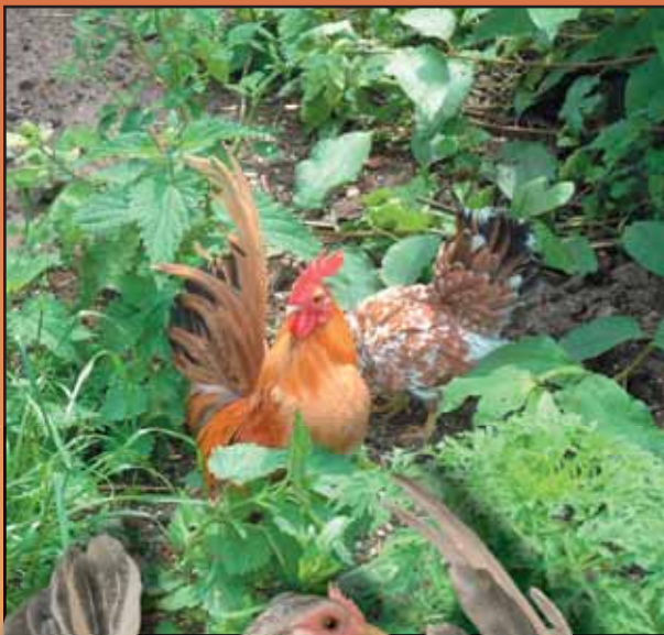
Serama between weeds.

The biggest flock of app. 70+ pure Malaysian Serama is located at one breeder in The Netherlands and the offspring is just as superb as the breeders.