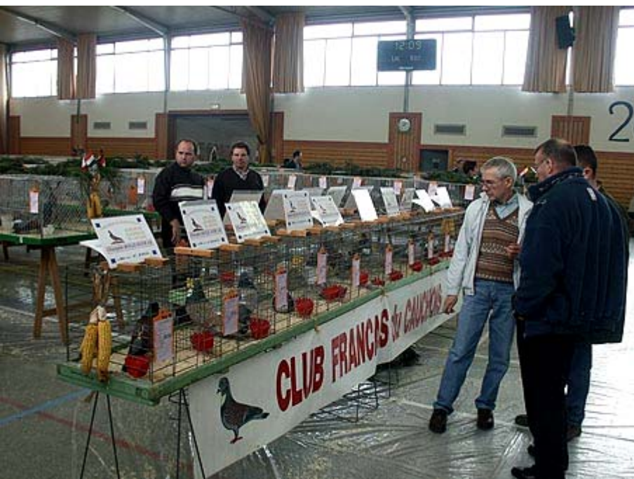
Left: The entries of the French Cauchois Club at the European Cauchois Show in 2004.

In the meantime, the Cauchois Europe Show developed into a show with over 800 Cauchois in 15 colour varieties. Today we see more uniformity in the exhibited birds.