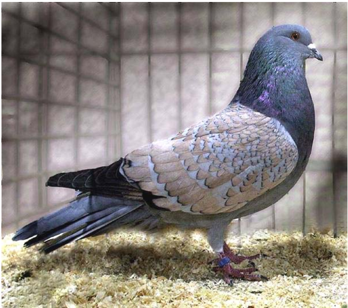
Club show at Menen. Above: best young male in show, rose spangled, Owner: Eric Vansevenant. Below: best old female in show, blue red bar. Owner: Erik Vanhee.