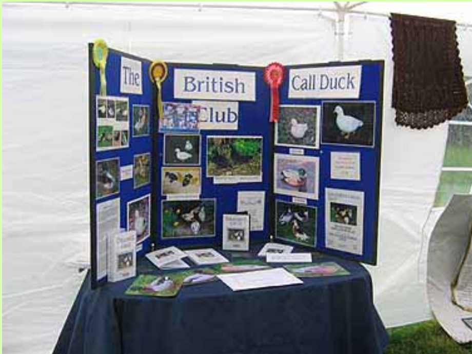
Left: British Call Duck Club Display.

Lately you see more and more of these ducks at our Shows, at the cost of geese i.e. This is due to among other things the costs of feed, shavings, entry fees and car fuel, which increase each month!