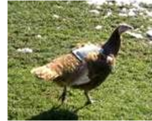
Turkeyhen with saddle