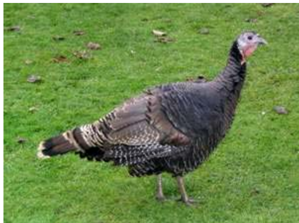
Bronze turkey hen

Turkeys need space and a much larger shed to live in than chickens; they will also roost at night at the top of the tallest tree if they do not have their wings clipped rather than go in their sheds. They take up much more room on the perch of my shed and can be quite unkind to the smaller birds that may push in on the perch between them. I have heard terrible tales of vicious stags attacking their owners but my hand reared birds are friendly and tame.