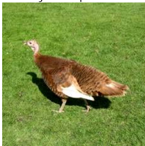
Buff turkey hen

Here in the UK we have a good choice of which turkeys to keep ranging from the White to the Buff, Bronze, Norfolk Black and Pied to name a few. Although not common they are reasonable easy to source and if you join the Turkey Club UK it certainly is easier to obtain good pure bred stock. http://www.turkeyclub.org.uk/index.htm